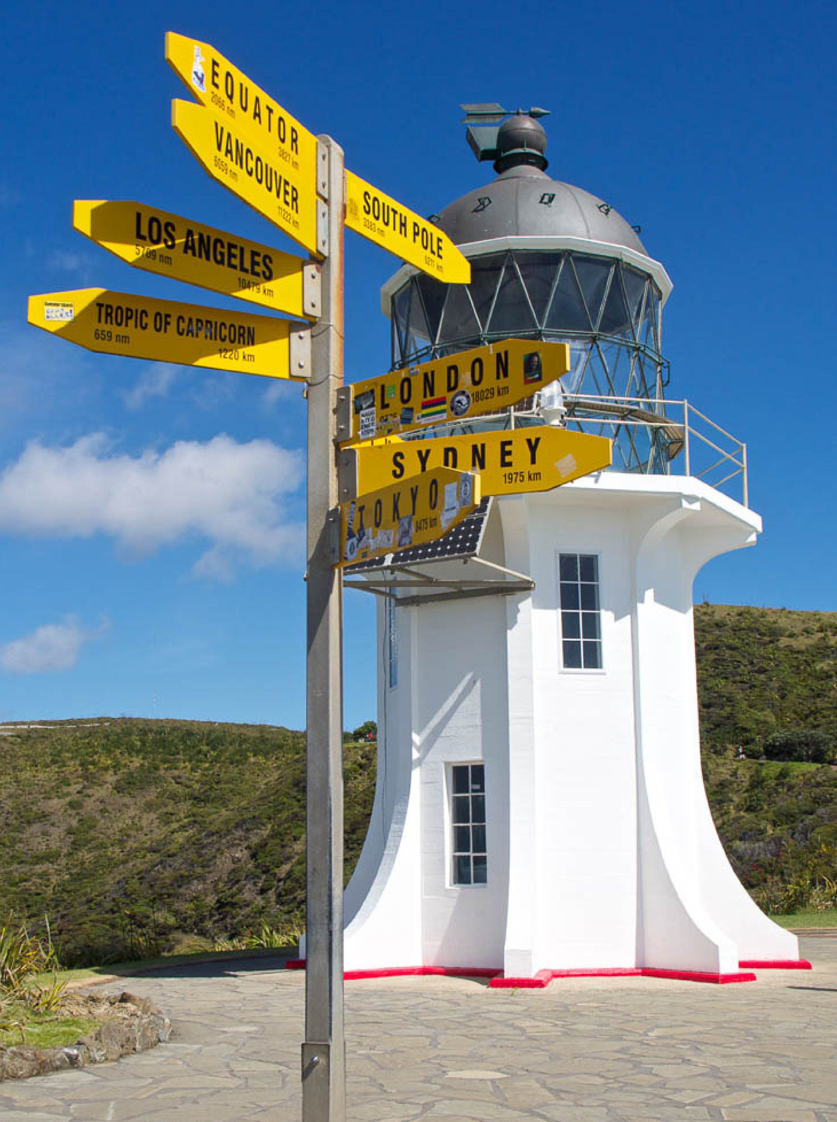
Beacon of Light The lighthouse at Cape Reinga